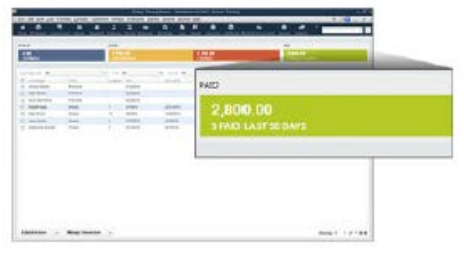
See the status of your transactions with the Income Tracker.