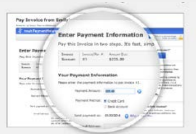
When customers receive your email, they can pay you right away online or from their mobile devices.