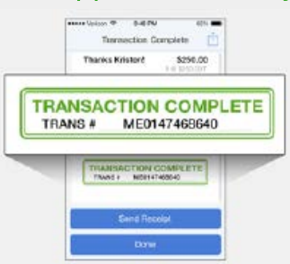
With the free GoPayment app, process payments right on the spot.